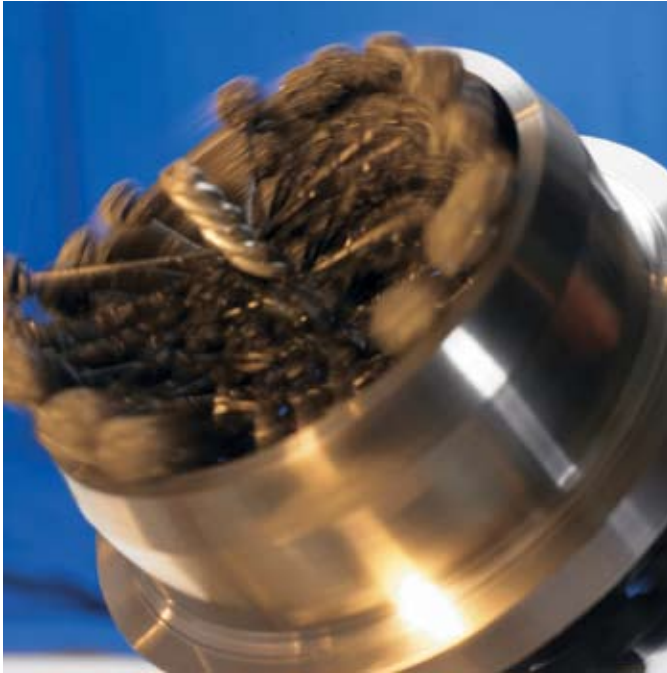
Flexible ball-style hones are available in various grit sizes and diameter sizes.

hones were especially proficient at doing that in the field.