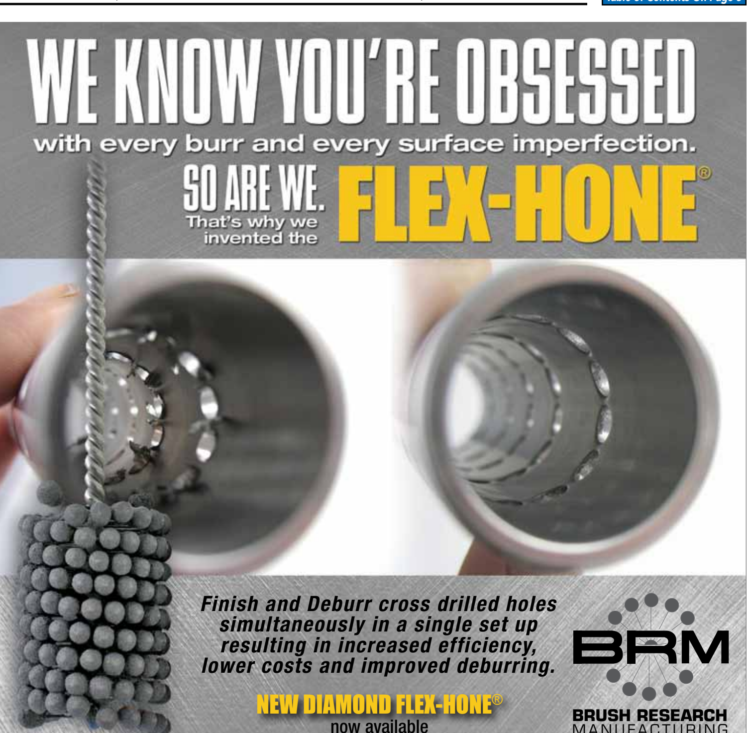
Table of Contents On Page 5